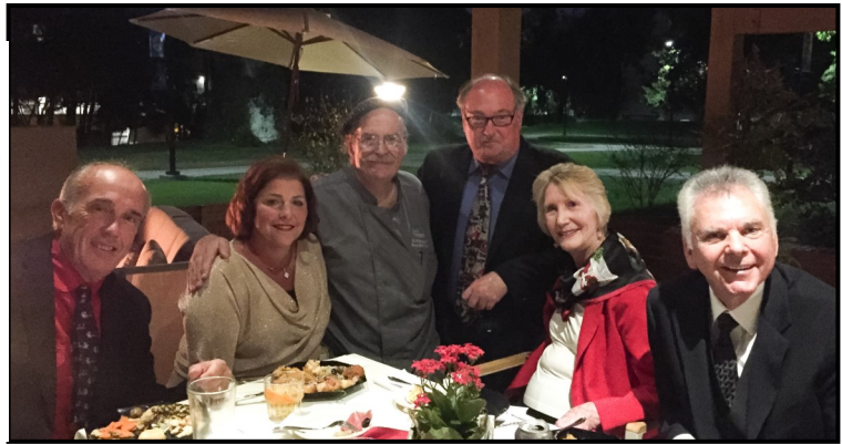
Members Holiday Party—December 4, 2016